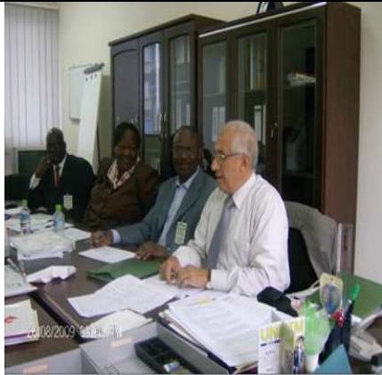
Jury committee for the 2009 AU award nominate at Work, 25 -26 August 2009-08-31

The Regional Jury Committee 2009 at work. The Jury was composed of the following members from extreme left: