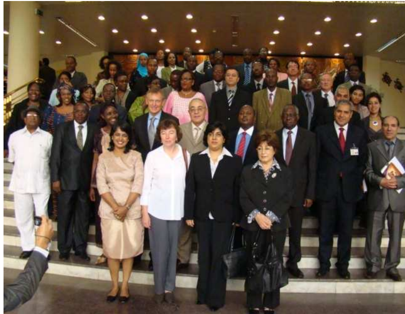
The Winners are in the front row

A brief profile of each winner by sector and region is as follows: