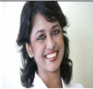
Prof. Ameenah Gurib-Fakim ( Earth and Life Sciences )